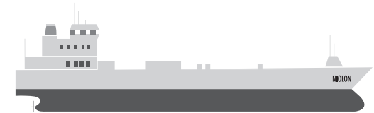
MARFRET NIOLON 1212 LM