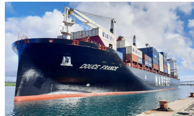
Shipyard CHINA - Hull YZJ2015-2018 Delivery 22 January 2020