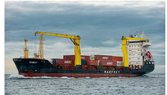
QINGSHAN Shipyard Hull N° KS960308 Delivery Dec. 2003